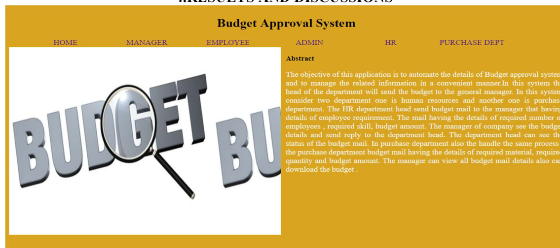
Fig 1:Home Page