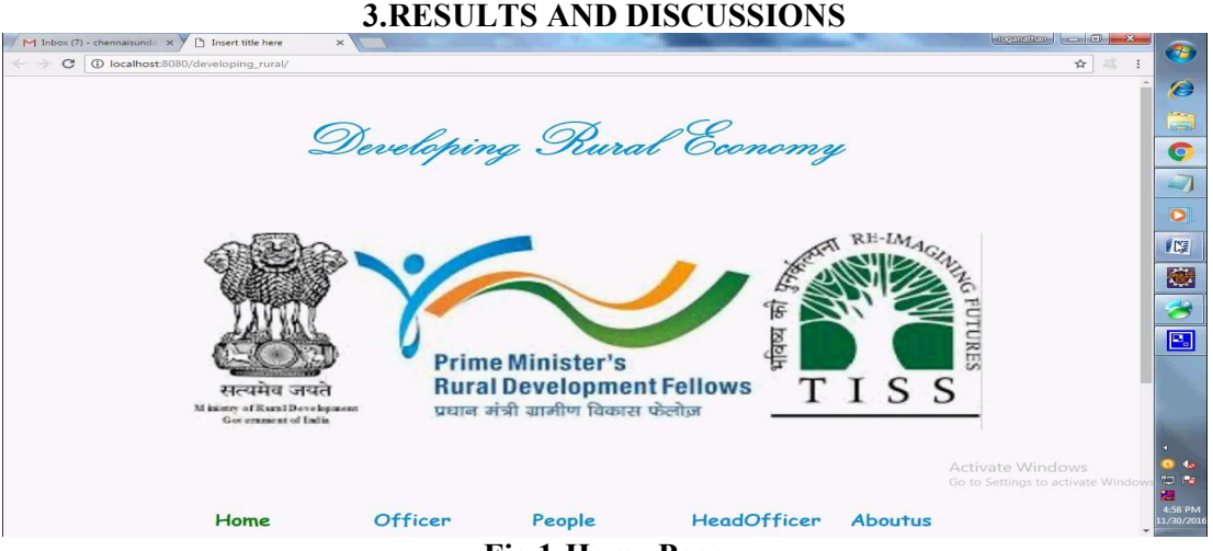
Fig 1:Home Page

admin can generate the bar chart based on which place people send the more request for medical team, its very useful for admin and medical team for sending a medical team person for which place need a more medical team.so they can easily find out and send a medical team to that particular place.