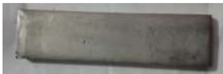
Figure 2 (a): Before EDM Cut