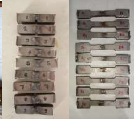
Figure 4: Welded Sample for Testing

After that performing the test, impact test on izod impact (a) and bending test on UTM(b). The outcomes achieved from all the three tests performed are mentioned below in table no. 3.