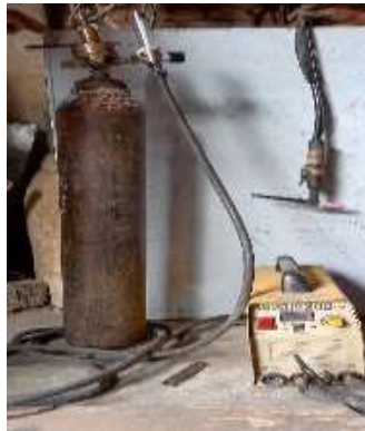
Figure 3: TIG Welding setup