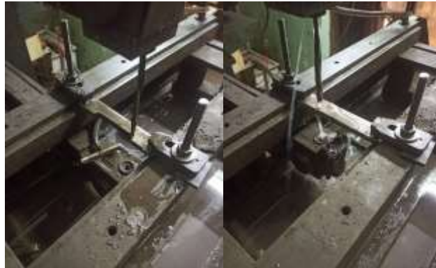
Figure 1: EDM Cutting

to achieve the desired cuts. EDM cutting process show in figure. Testing sample dimension according to the ASTM standard as show in fig.2 (a) and fig.2 (b). Then implementation of taguchi optimisation, 19 taguchi's orthogonal array in design of experimental method utilise 3 levels of current, 3 level of welding speed and 3 level of gas flow rate as show in table no.2. The experimental procedure of L_9(OA) have been developed by MINITAB 19 software, 19 array show in table 3.