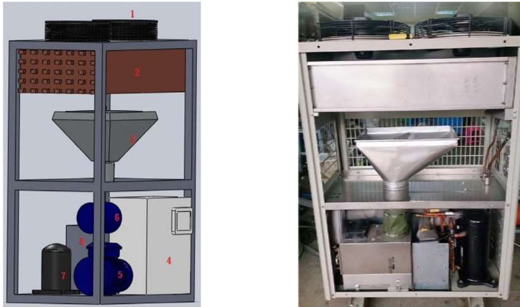
Fig.2 Supersonic vaporization chiller system

Fig. 3 is a diagram of the closed-loop system. Its main controls are a supersonic oscillation driving circuit (SOD), a pulse-width modulation (PWM) control circuit, and a dual-effect fuzzy control (DEFC). The main functions of the controls are as follows: