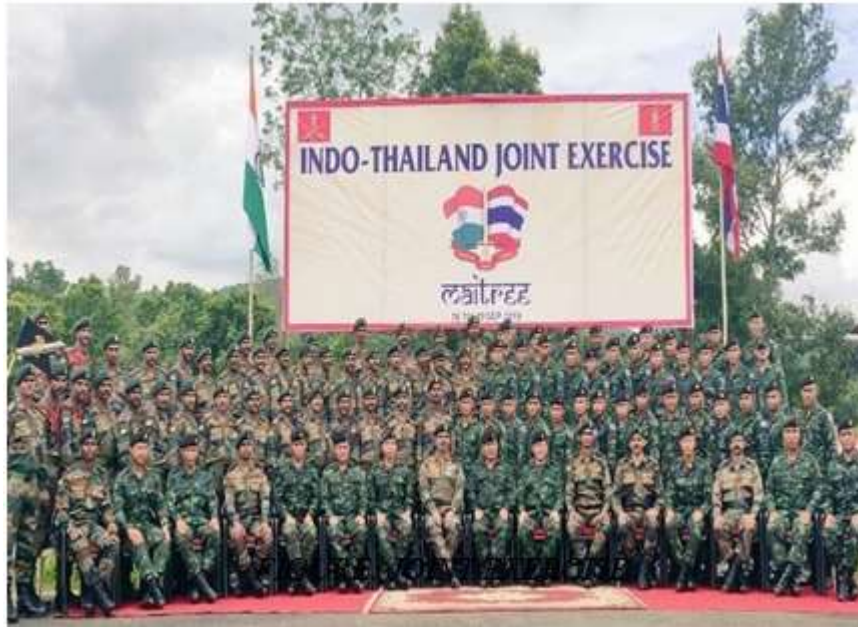
FIGURE: JOINT EXERCISE

In conclusion, army exercises in the Indo-Pacific region have become an increasingly important aspect of international security and diplomacy in recent years. These exercises are designed to enhance military readiness and cooperation between countries in the region, and are a means of demonstrating commitment to regional security and stability. The increasing number of army exercises in the Indo-Pacific region is a reflection of the changing strategic landscape in the region and the need for countries to be prepared for any eventuality.