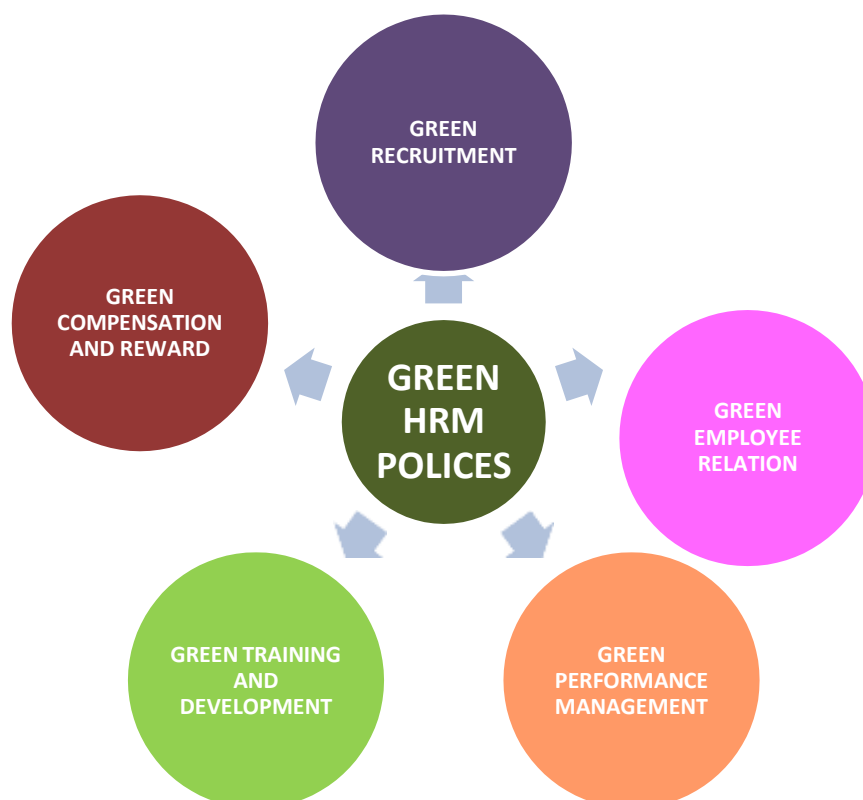
Figure 1: Green Human Resource Management policies

The process of employing new employees who are knowledgeable of environmentally friendly practices and, environmental concerns, as well as the language of preservation and sustainable environmental policies, is known as green recruitment. To proficiently perform environmental management inside the company, institutions should ensure that new talent is conversant with green practices and environmental systems.