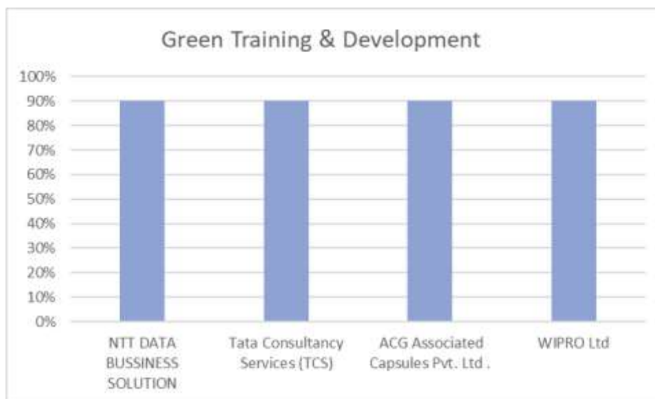
Fig 3: The percentage of implementation of green training and development.