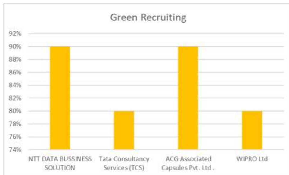
Fig 2. The percentage of implementation of Green recruitment

The analysis of secondary data from four companies is conducted. Green HRM policies such as green recruitment, green training and development, green compensation and reward, and green performance and appraisal are studied with the data. The analysis of the percentage of implementation of green HRM policies is studied using the data.