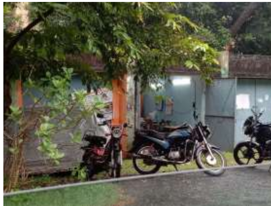
Parking being used as a studio at Vizag Steel plant Township

One of the important findings from a live case study that supports my hypothesis is of “Visakhapatnam Steel Plant Township, Ukkunagaram”. The following observation has been recorded as on the day of site visit.