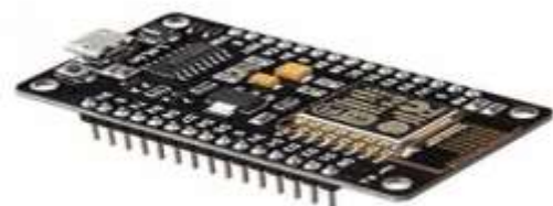
Fig -2: Node MCU (esp8266)

NODEMCU (esp8266) has been selected as the controller for this system due to its compact size, compatibility, easy interfacing over several other type of controller including Programmable Integrated Circuit (PIC), Programmable Logic Controller (PLC) and others. ESP8266 is an open source firmware that is built on top of the chip manufacturer's proprietary SDK. The firmware provides a simple programming environment, which is a very simple and fast scripting language TheESP8266 chip incorporates on a standard circuit board. The board has a built-in USB port that is already wired up with the chip, a hardware reset button, Wi-Fi antenna, LED lights, and standard-sized GPIO (General Purpose Input Output) pins that can plug into a bread board. Figure-3 shows the diagram of NODEMCU (ESP8266). It has Processor called L106 32bitRISCmicroprocessor core based on the Tensilica Xtensa Diamond Standard 106Micro running at 80MHz and has a memory of 32 Kbit instruction RAM ,32 Kbit instruction cache RAM, 80 Kbit user data RAM&16 Kbit ETS system data RAM. It has inbuilt Wi-Fi module of IEEE 802.11b/g/n Wi-Fi