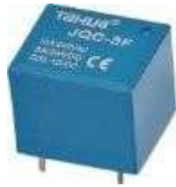
Fig -3: Relay

common (COM). By using the proper combinations of the contactors electrical appliances may turn ON or OFF.