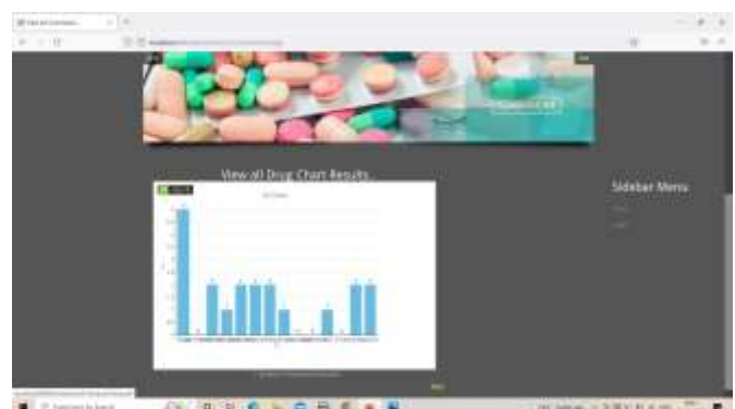
Screen 6: Bar Graph Showing all Drug ranked Search Information