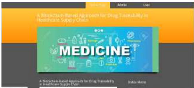
Screen 1: Home Page for Block Chain Based Drug Traceability