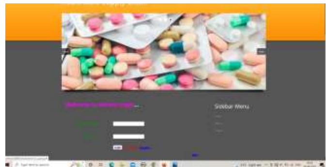
Screen 4: User Login for Drug Traceability