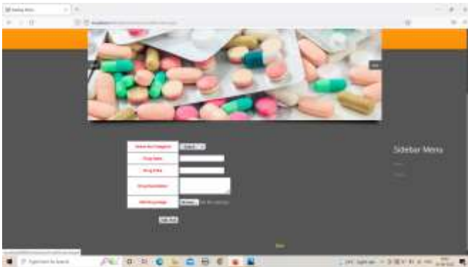
Screen 7: Pharmacy Seller Adding New Drugs and their Availability