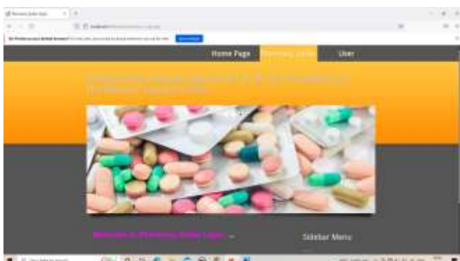
Screen 2: Home Links Showing Pharmacy Seller and User Login Activities