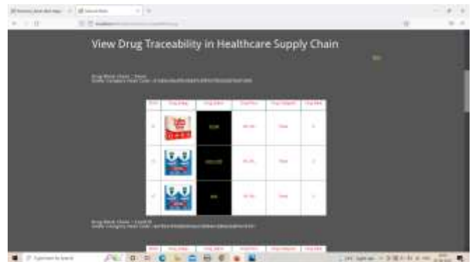
Screen 5: Report Showing Drug Block Chain for a keyword Entered