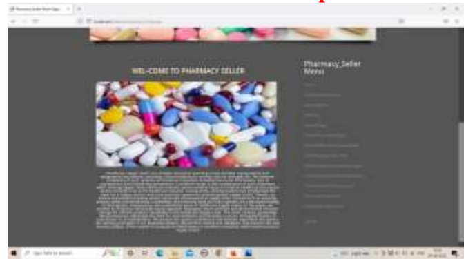
Screen 3: Menu Activities of Pharmacy Seller

The Ingredient Supplier provides all basic aspects required to manufacture the specific drug. Before starting the Production, Manufacturer need to take authenticated certificate from (Food Drug Association)FDA. After the approval, manufacturer starts production of drugs. Manufacturer transfer Drug lot to Primary Distributer and packager. The packager develops new packaging and transfer repackaged drugs to Secondary Distributer. The both primary and secondary distributor distribute drug lot to hospitals and directly to the pharmacy shops. In the patient block, we can include customers of pharmacy shops and patients of hospitals.