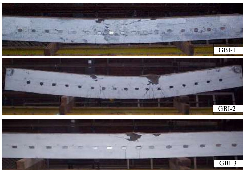
Figure 2 – Beams after test

In all cases, the flexural cracks formed in the pure bending moment zone. As the load increased, existing cracks propagated and new cracks developed in the shear spans. For some beams diagonal cracks also developed in the shear spans. Figure 2 shows some of the beams after failure; others were similar.