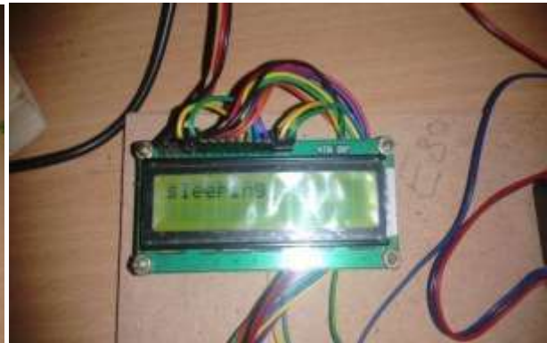
Fig (b) LCD response on drowsiness detection