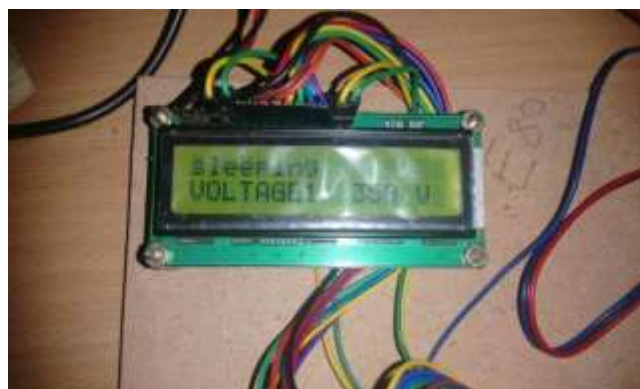
Fig (c): normal eyeblink message on LCD