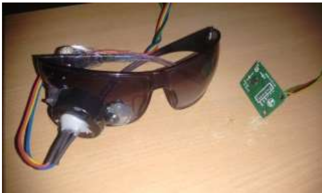
Fig (a) : IR sensor & Accelerometer

Fig (b) and Fig (c) indicates the LCD messages displayed during response of drowsiness detection conditions. In case of normal eye-blink LCD Screen displays the voltage recorded during opening and closing of eyelids. While in case of drowsiness LCD screen Shows —Sleeping! message and initiates the physical alarm.