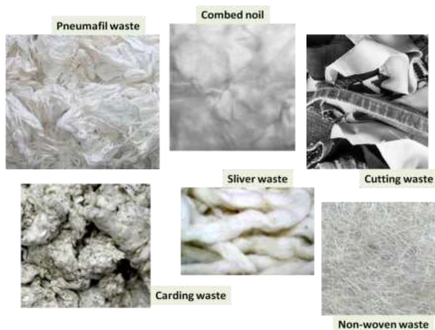
Figure 3. Examples of waste originated by textile world.

According to the study on textile waste lifecycle by Domina and Koch [42], all these different forms of solid waste, coming from fabric and apparel, can be grouped into two broad categories: one concerns the unsold merchandise and pre-consumer waste generated by retail that can be easily re-integrated through outlet, jobber, or non-profit organizations; another regards the post-consumer waste of fiber (yarn, fabric scraps, and apparel cuttings) generated by fiber producers, textile mills, fabric, and apparel manufacturers. For these latter, there are three possible disposal routes: (i) to be stored in the landfills, (ii) to be burned in incinerators in order to be converted into energy or powder, or (iii) to be sold to a textile waste recycler and re-converted into reusable goods.