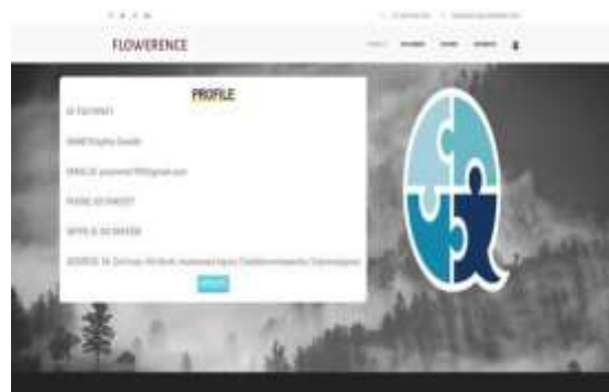
Figure 6: patient dashboard

Patients page – allows the doctor to confirm the appointment, share reports to the patient and also view the history of the patient.