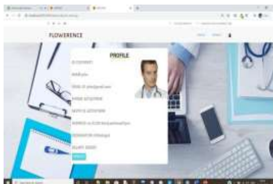
Figure 5: doctor dashboard

View tab– allows admin to view the patients, doctors and staff details and also alter them.