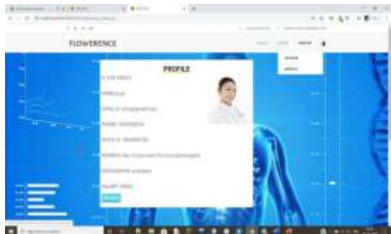
Figure 3: pharmacy staff dashboard

Main page has the profile of the staff member.