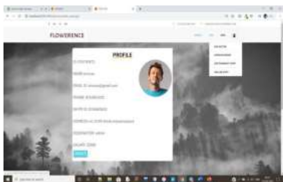
Figure 4: admin dashboard

Medicine tab- allows the user to update prices and stock details of existing medicines and add new medicines.