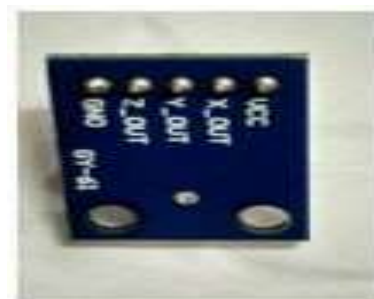
Figure 3 (b) Accelerometer rear side