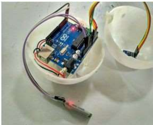
Figure 4 (a) Electronic packaging

Generally any electrical and electronic devices generate some sort of signal which has a capability to interfere with the normal working of some other nearby electronic equipment's. This phenomenon is coined as Electro Magnetic Interference. EMC (Electro Magnetic Compatibility) is to be achieved for eliminating the EMI, in which Electronic packaging is one of the methods. In this work, MEMS equipment is made to fit into a ball made up of a plastic material through which the compactness and also the compatibility is achieved which helps in protection from the hazards like mechanical damage, exposure to the outside weather conditions, thermal shocks/fluctuations, EMI(Electro Magnetic Interference).