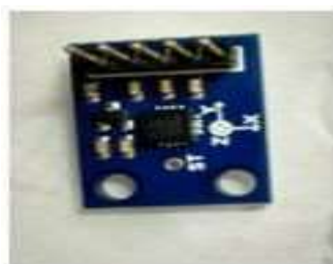
Figure 3 (a) Accelerometer front side

Accelerometer is a device which can sense and convert the acceleration into the voltage using piezoelectric effect. The quartz crystals present inside the accelerometer sense the slightest change in the acceleration and there by change in the voltage will be obtained. The output obtained can be of digital or analog type. [8] The accelerometer ADXL-335 of low power 3- axis with a range of +/- 3g is used in this work. Its dimensions are 4mm x 4 mm x 1.45 mm.