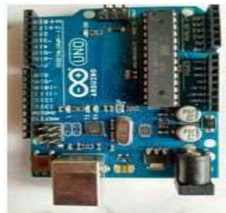
Figure 2 Arduino UNO

Accelerometer is a device which can sense and convert the acceleration into the voltage using piezoelectric effect. The quartz crystals present inside the accelerometer sense the slightest change in the acceleration and there by change in the voltage will be obtained. The output obtained can be of digital or analog type. [8] The accelerometer ADXL-335 of low power 3- axis with a range of +/- 3g is used in this work. Its dimensions are 4mm x 4 mm x 1.45 mm.