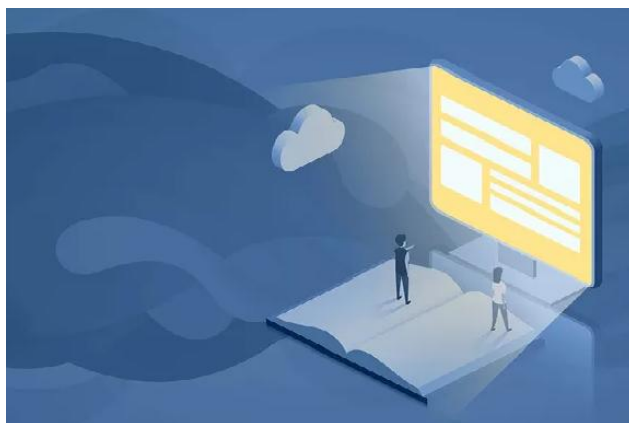
Fig 1 : Virtual Classroom