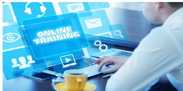
Fig 4 : Virtual Training

Virtual Training means the training which is done in a simulated or virtual environment, or when the locations of the learner and the instructor are separate. It refers to the online spaces that are designed for training.