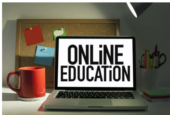
Fig 2 : Virtual Education